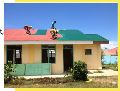
Patag Elementary School is almost finished in its reconstruction.

We also received many pledges from various Rotary Clubs or Rotary Districts abroad, among which is a £93,000.00 pledge or approximately US$149,000.00 from RIBI Donation Trust which we plan to use to reconstruct the earlier mentioned three schools in northern Iloilo. Of course, we also have the P3,000,000.00 pledge from Cocolife.