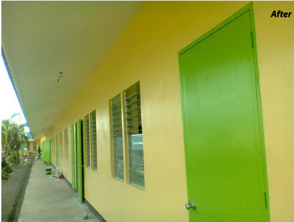
(Left photo) HARPDI takes the lead in the reconstruction of San Jose Elementary School in Ormoc as new school structures are being erected to replace those damaged by Typhoon Haiyan/Yolanda .